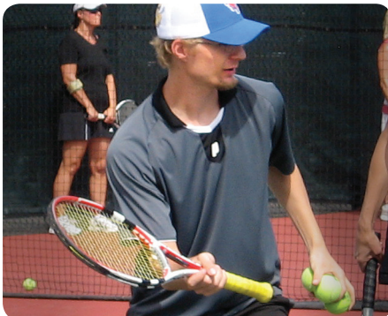
Great fun at the Family Festival & Tennis Open

The appearance of three anti-tax measures on the ballot (Amendments 60 & 61 and Proposition 101, known as the “Bad Three”) posed a major challenge to our communities, and schools and colleges. Great Ed found the silver lining, converting efforts into an opportunity for education. In conjunction with our 501(c)(4) affiliate, Great Education Colorado Action, our fast-working staff and volunteers: