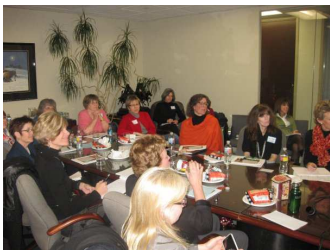
Great Education Colorado volunteer meeting

“Education is increasingly recognized as one of the preeminent civil rights issue of our time.”