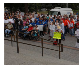
Save our State rally, September 2009

In September of 2009, Great Ed joined other advocacy groups and citizens at a rally at the Capitol urging our elected officials to consider all options in addressing our state’s budget crisis.