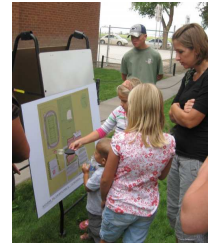
Students at Sangre de Cristo Elementary look at layout of new school

BEST, the most significant legislative investment in Colorado school construction since statehood, was inspired by Great Ed’s statewide tours for state leaders in 2007 and 2008. Governor Ritter signed BEST into law on May 22, 2008. In 2009, more than $100 million in construction projects was spent to improve our state’s schools.