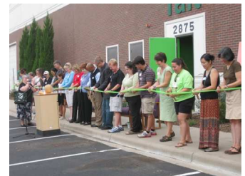
RAFT grand opening on Oct. 4 in Denver

The first Great Education Colorado Volunteer Day was at the Resource Area for Teachers (RAFT), which provides a tangible, effective way to help kids and teachers. We did the set-up work while volunteers put together low cost electric circuit kits and DNA models for teachers who need hands-on, interactive student experiences at affordable prices. All materials were donated from businesses who would normally discard the items.